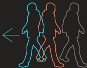
People flow and traffic analysis