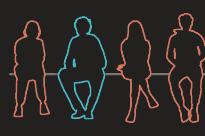
High quality pattern of life metadata