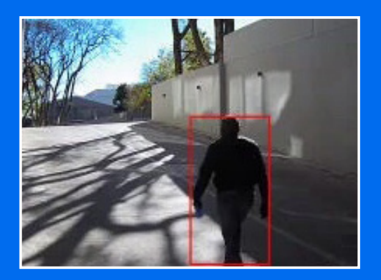
innoVi has detected perimeter breaches and instances of loitering outside the property line, allowing CAP to avert crimes at the properties they monitor