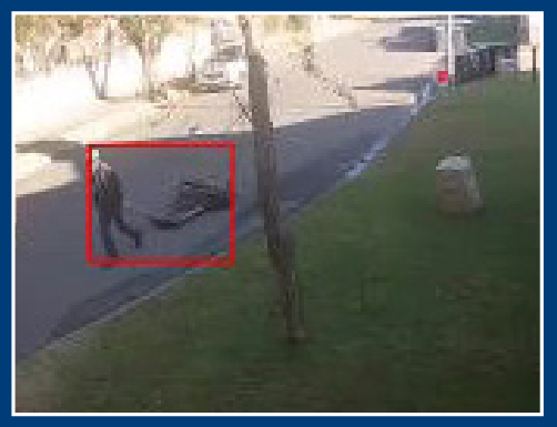
innoVi's Anomaly Detection technology detects unusual behavior, alerting CAP's Command Center to events of interest that would otherwise go unnoticed