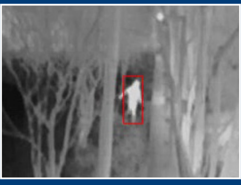
A night time detection by innoVi on a thermal camera; innoVi can connect to any ONVIF/RTSP IP camera via innoVi Edge