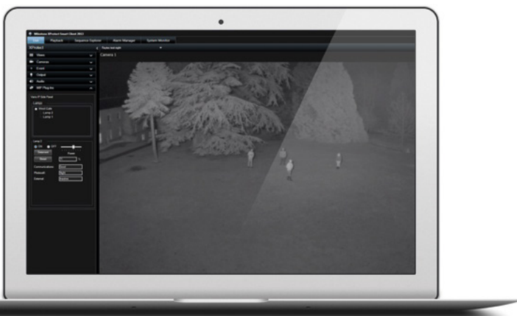
Live Lighting Operation within Milestone Smart Client

Available in Infra-Red or White-Light LED variants, VARIO IP can be controlled individually or in groups making it much easier to control large sites. Operators can also make live adjustments to any single Raytec illuminator or group of illuminators via the Smart Client any time, to optimise image quality for the best night time surveillance 24/7.