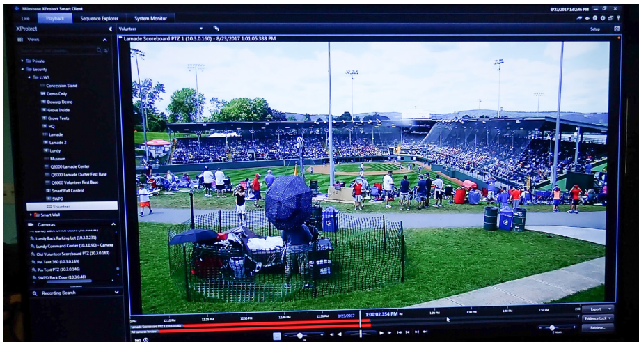
Milestone XProtect VMS